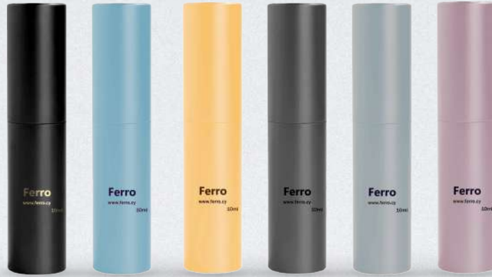
Black Turquoise Rose Gold Gray White Pink