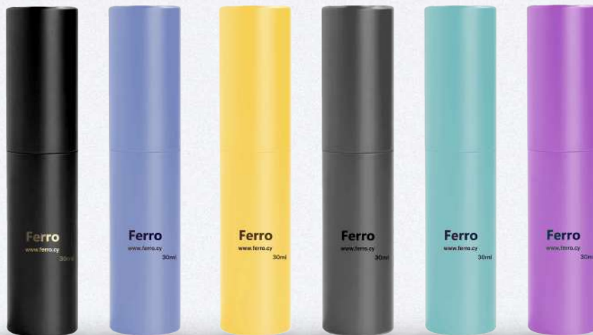
Black Light Blue Gold Gray Green Purple